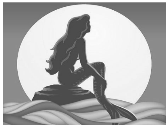
July 21 - August 7